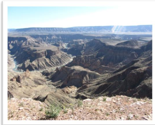
14 The Canyon