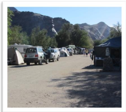
15. The parking lot