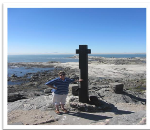
9 Diaz Point