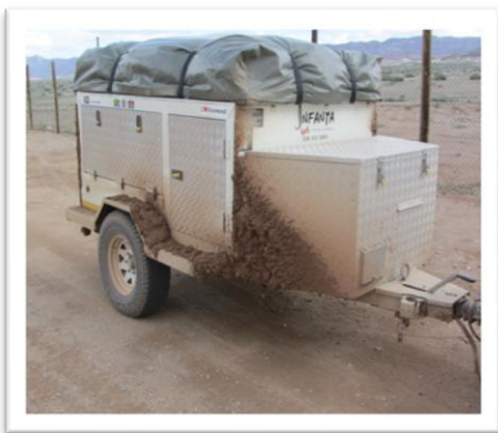
7 Trailer before 'demudding'

Very soon Hendrik had the donkey going, and we were tucking into some of the good red juice from the Fairest Cape – it was cold and wet, but very grateful that we only had to drive an additional 160km and not 400 to get where we'd got to.