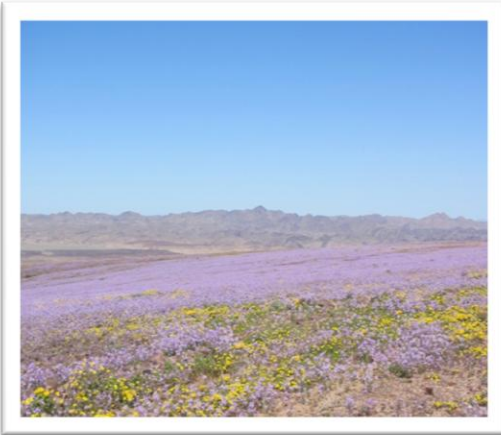
13 The flowers of the Fish River Canyon

We took the drive along the canyon – designated as a 4x4 route – and were greeted by another riot of floral colours. The recent rains had resulted in a spectacular display of yellow and blue flowers.