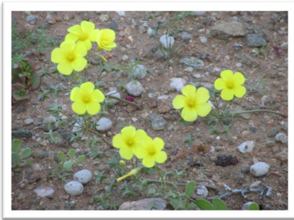
4 Flowers of Richtersveld

There had been recent rains in the Richtersveld and it was green with a profusion of flowers varying in colour from white, yellow, blue, mauve, red, violet and a number of shades in between.