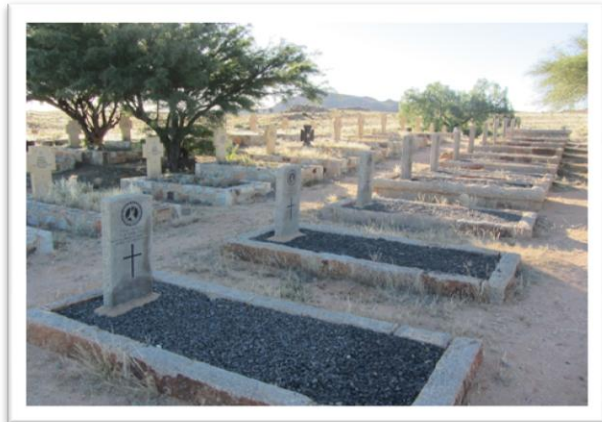
12 Commonwealth War Cemetery