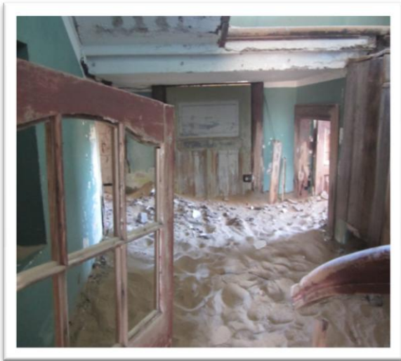
8 Architect's residence Kolmanskop