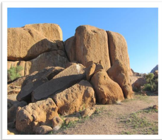
5 Granite rocks.

And then there was the incredible rock formations – the igneous granite rocks that have been weathered over the millennia to create this incredible landscape (no, geology and astrology is not on the bucket list - yet).