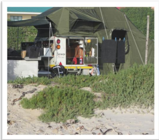
1 McDougall's Bay -our campsite taken from high water mark

The weather cleared as we came down the escarpment and it turned out to be a glorious winter's day. McDougall's has got a fantastic setting – we camped about 15m from the high water mark. Certainly closest I've ever camped to the sea (note this is different to sleeping close the sea on the beach). Even beats camping at Tiwi Beach in Kenya, where you are also right on the beach.