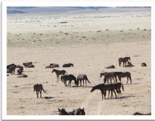
11 Feral horses near Aus

So something else goes onto the list of knowledge expansion.